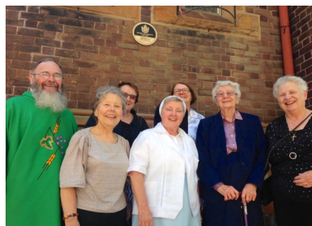
Laying of the Sisters of Charity plaque at St Canice's - 26 October 2014