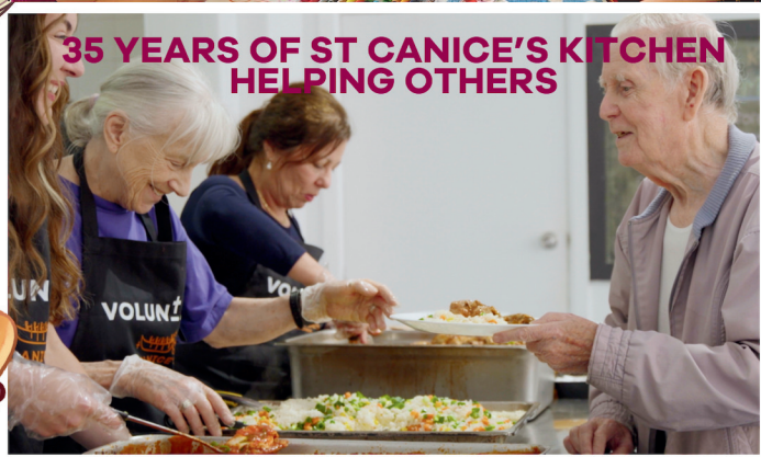
35 YEARS OF ST CANICE'S KITCHEN HELPING OTHERS