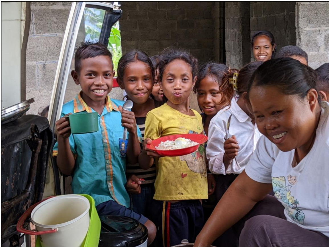
Children in Railaco happy to receive a freshly made protein-rich meals thanks to the Feeding Program supported by St Canice's Parish