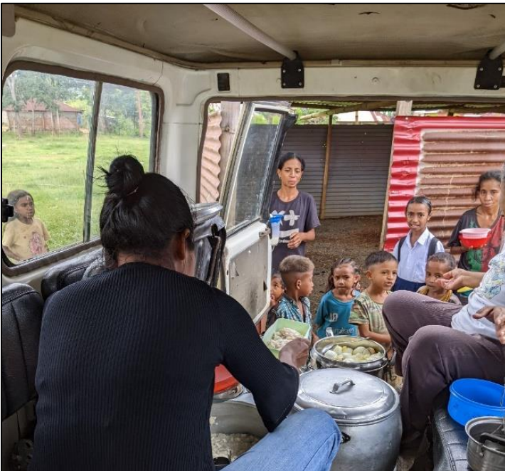
Children line up to receive their freshly made protein rich lunch.