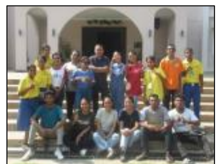
The Class of 2023 celebrate their graduation.