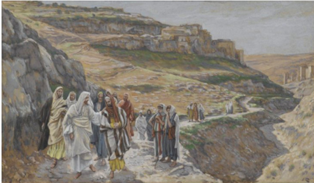
Jésus s'entretient avec ses disciples (Jesus discourses with his disciples) by Jacques Joseph (James) Tissot (French, 1836–1902), gouache over graphite on grey wove paper, c. 1886–1894, Brooklyn Museum, New York, public domain.

Tissot depicts Christ gathered closely with his disciples during the farewell discourse, the intimate teaching given on the night before his Passion. The Lord sits among them not as a distant master but as one who draws his friends into confidence, instruction and consolation. Around him, the disciples listen with varied gestures of attention, perplexity and love, their bodies gathered into a compact circle that suggests the first fragile form of the Church.